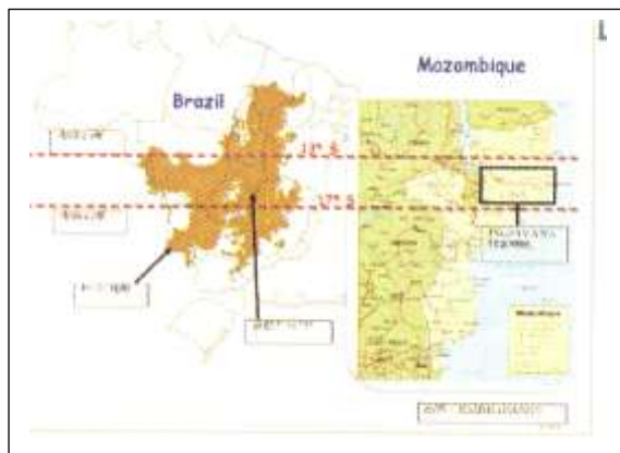
Map 1 JICA’s map distributed at an symposium (June 13, 2012)

The “tropical savannah” climate area is limited to the northern region in Mozambique. This is one of the main reasons why the ProSAVANA programme targets Northern Mozambique. For the planner of the ProSAVANA, the geographical similarities between the Cerrado and Northern Mozambique is also evident as seen in the following map, showing the same latitude of these two regions. This argument is used by almost all the JICA documents on ProSAVANA up to now.